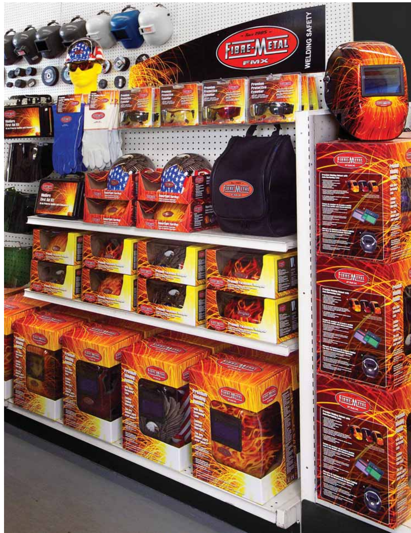
Merchandising that sizzles. FMX packaging and POP are designed to boost traffic and impulse sales.