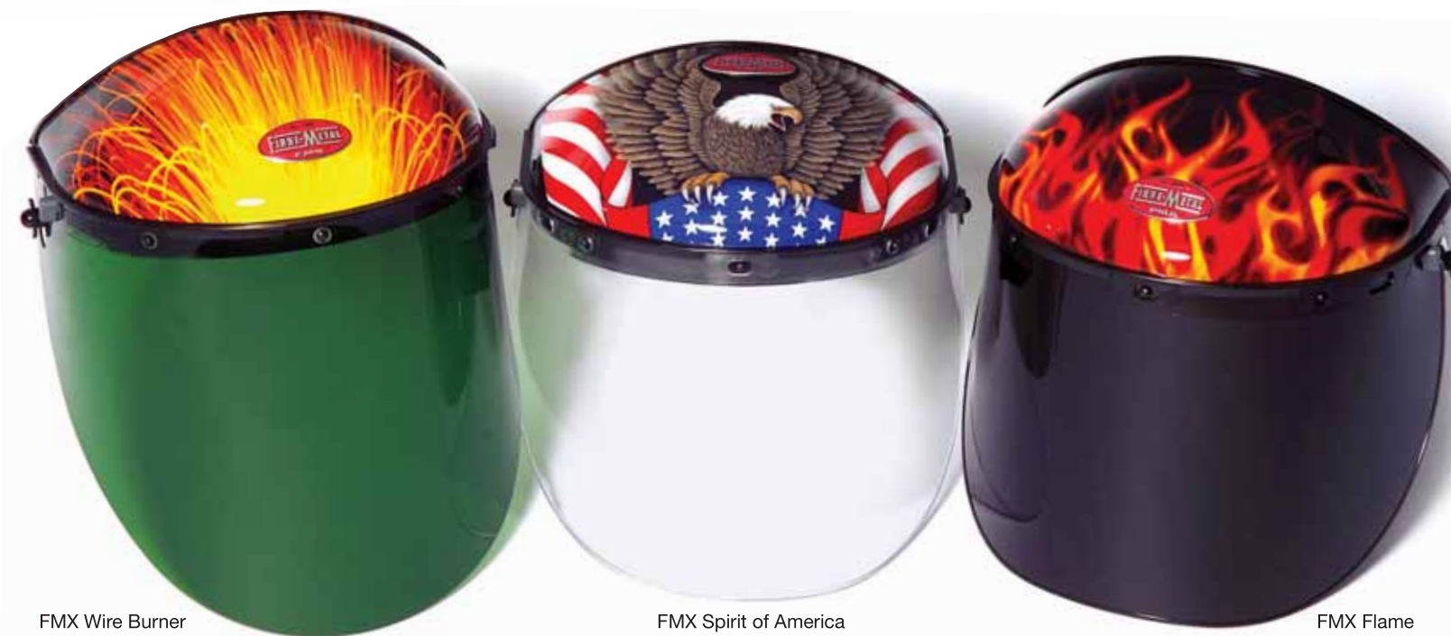
FMX Wire Burner